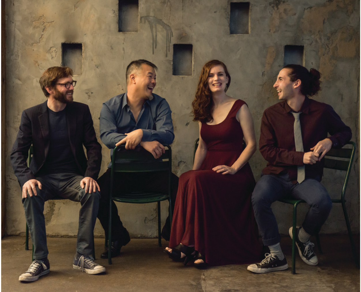
Del Sol Quartet.