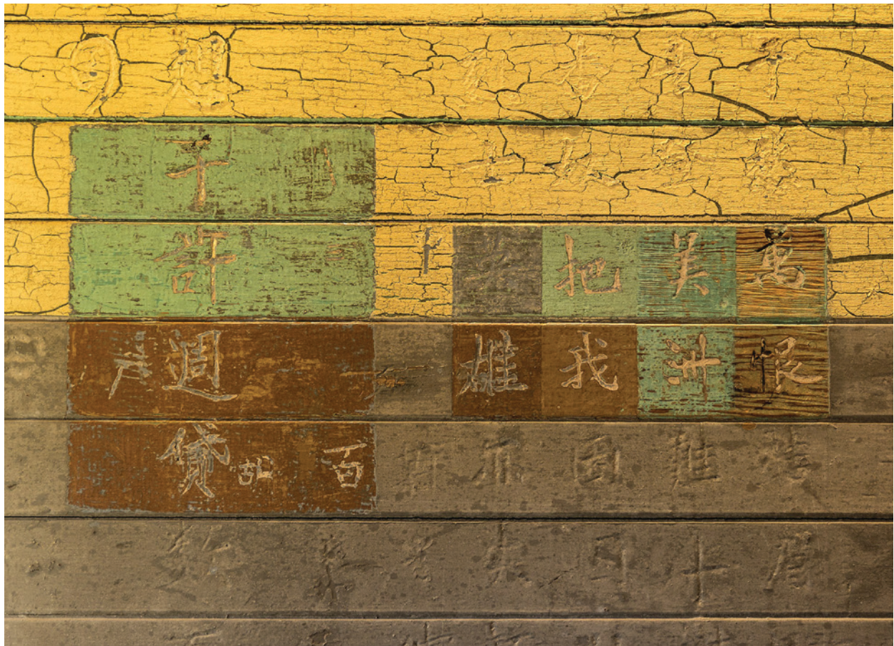
Poem on the walls of the Angel Island Immigration Station, California.