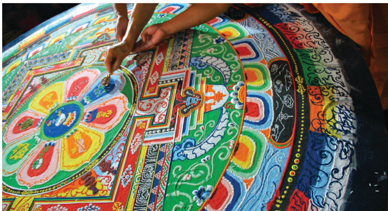
A Tibetan sand mandala, about to be ritually destroyed.

Del Sol Quartet Huang Ruo (b. 1976) A Dust in Time , passacaglia for strings (2020)