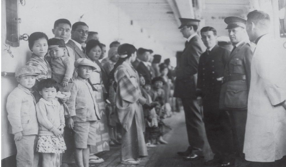
Japanese arrivals being examined by U.S. immigration officials aboard a ship docked at Angel Island Immigration Station, 1931.