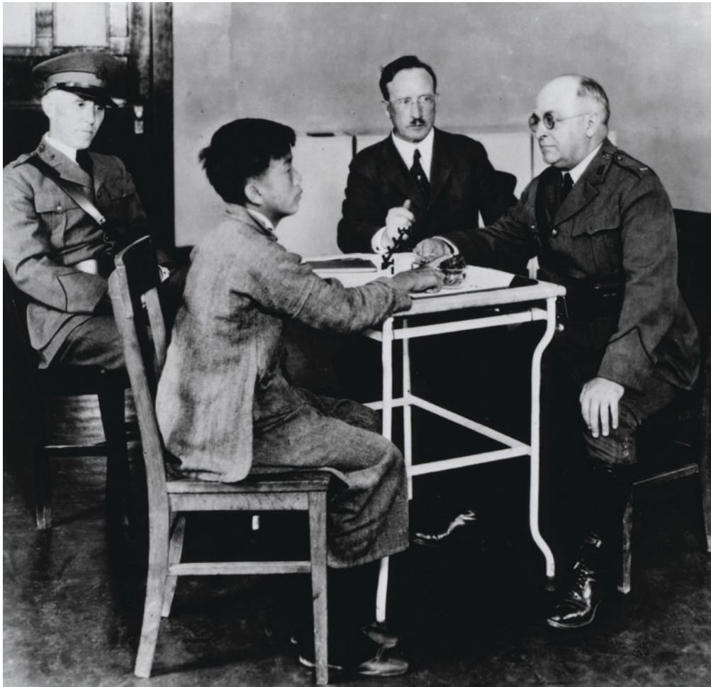
An interrogation at Angel Island.