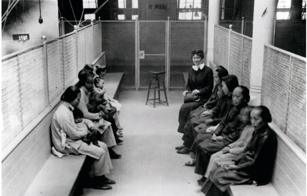
Immigrants detained at Angel Island Immigration Station.

雖削南山之高竹，寫不盡離騷之詞。 竭東海之波流，洗不淨羞慙之狀。 然或者，狄庭行酒，晉愍不辭青衣之羞 漢軍降奴，李陵曾作椎心之訴。 古人如此， 今人獨不忍乎？ 夫事窮勢迫，亦復何言？ 藏器待時，徒空想像。