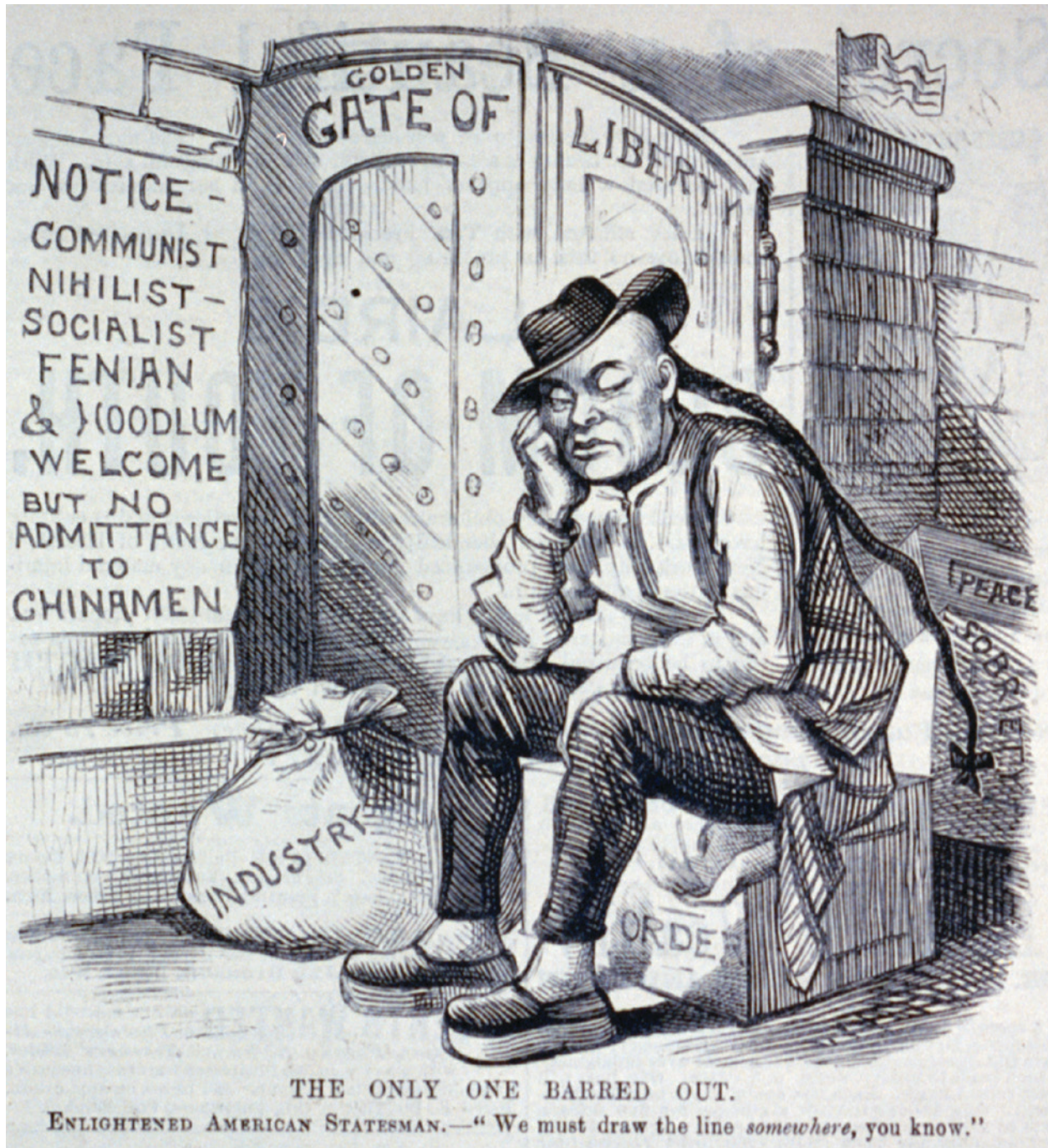
Cartoon by Frank Leslie.